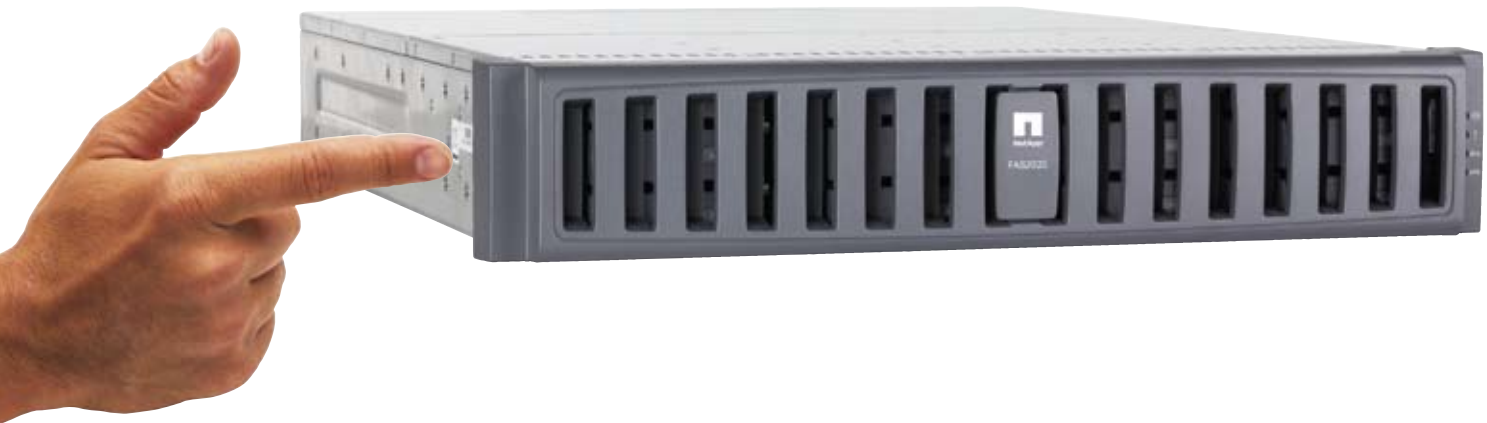
Figure 1) FAS2020 system.