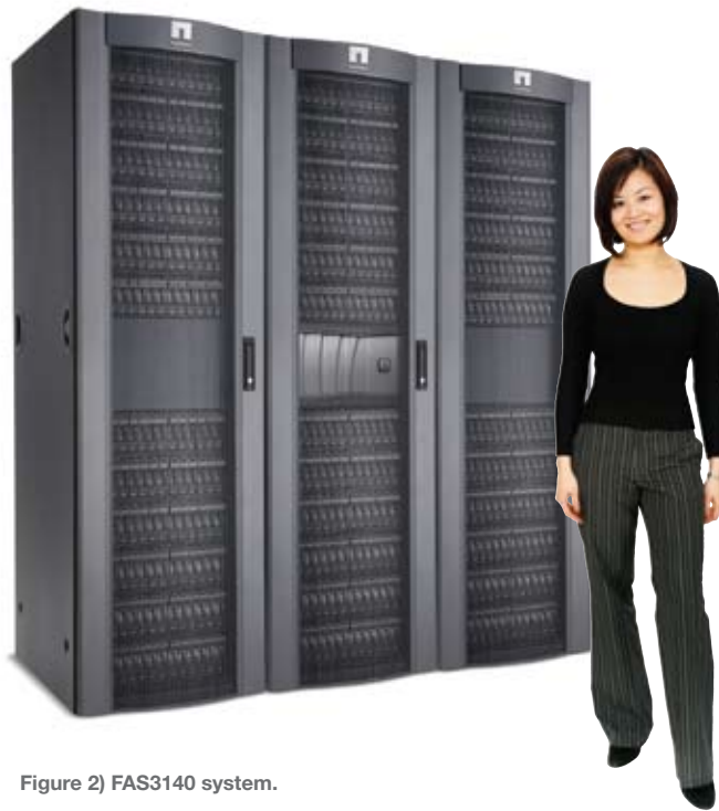
Figure 2) FAS3140 system.

Snapshot technology to provide you with incremental block-level synchronous and asynchronous replication. SnapVault®, in contrast, uses our Snapshot technology to perform block-level incremental backups of your data to another system. You can be assured of consistent backup images and application-level recovery in minutes when you use our host-based SnapManager® software, which integrates Snapshot management with your applications.